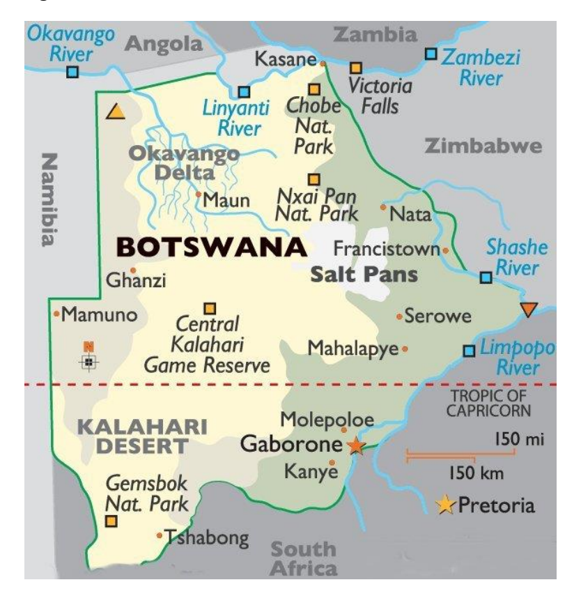
Figure 1: Botswana Orientation